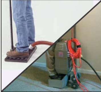
Begin with good extraction