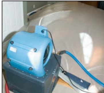
Tenting woods dries faster with less damage