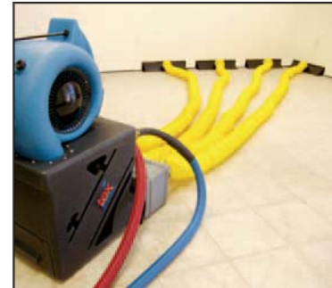
Inject heat into wall or ceiling when vapor barriers such as vinyl wall coverings exist.