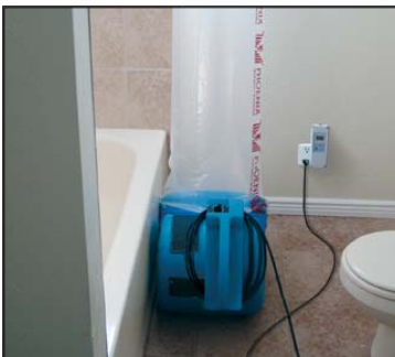
Thermostatically controlled exhaust dumps excess heat & humidity to the outside.